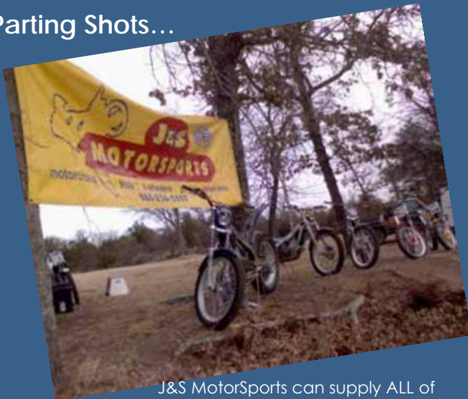
J&S MotorSports can supply ALL of your trials needs 580-226-0600