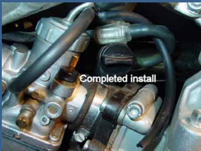
Once the installation is complete it should look something like this (or neater). The main loop of tubing could go behind the throttle cable for a cleaner look.