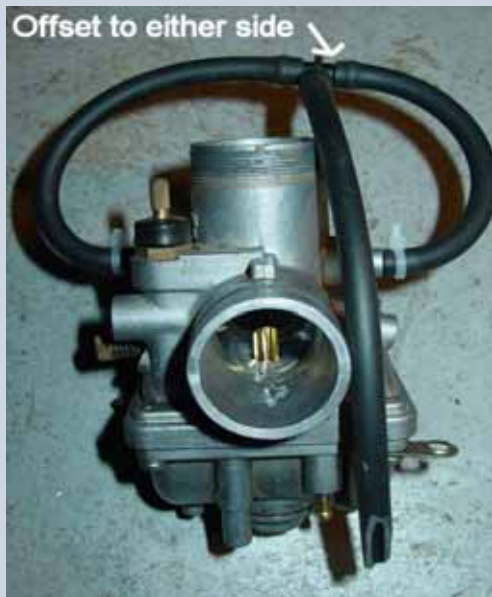
Install your arrangement of hoses as shown, note that you can offset to either side to suit your needs. Use zip ties if required

Use the tee fitting to join the three pieces. Notice that the end of the middle hose is cut off at an extreme angle. You can see it in a couple of the pictures. This will stop the siphon effect and is an important step. Install the assembly and route the hoses for a neat and clean look. This