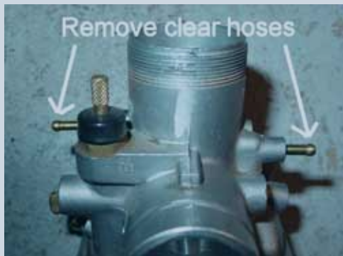
First, remove the stock, clear plastic hoses